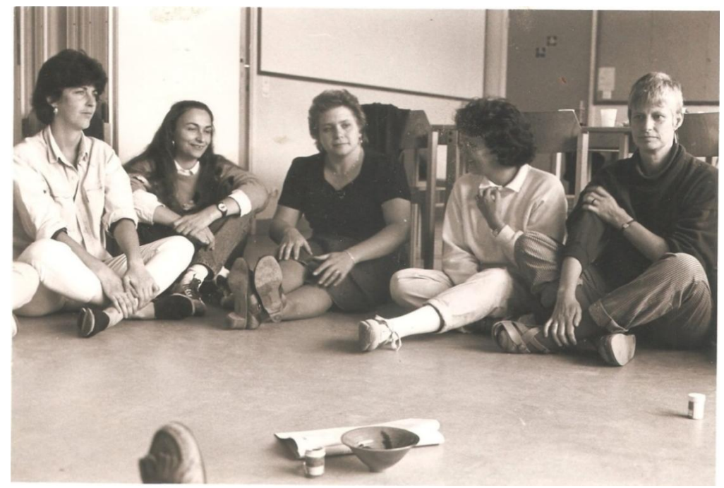
The Anointing at Bethany: Paris 1988