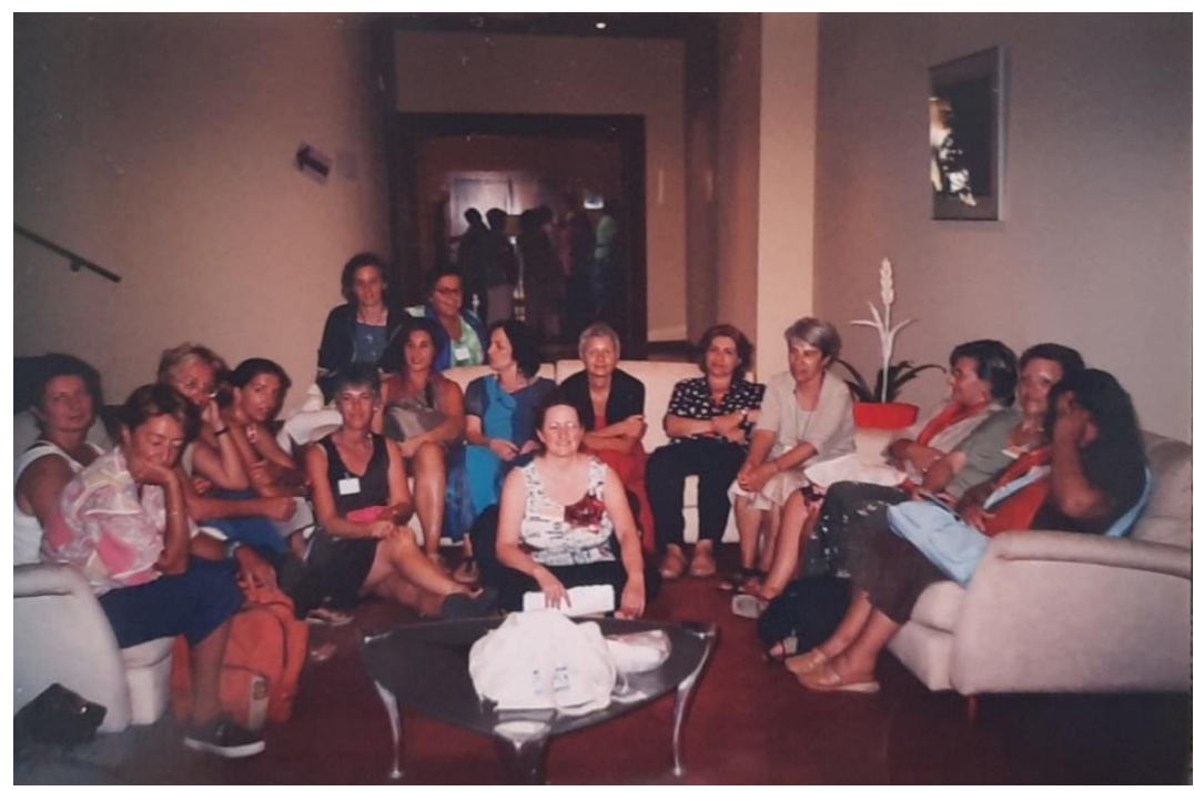
Barcelona 2003 – a group of participants from Italy

A plural subject was being born that would soon journey together. The encounter was between the Base Community Women, on the one hand, and women from other groups, on the other hand. All shared a common passion for questions of faith and spirituality as well as a desire to journey separately from men, not as an end in itself but as an important way of freeing and valuing women's speech and gaze so that we could stand with our own vision in the world.