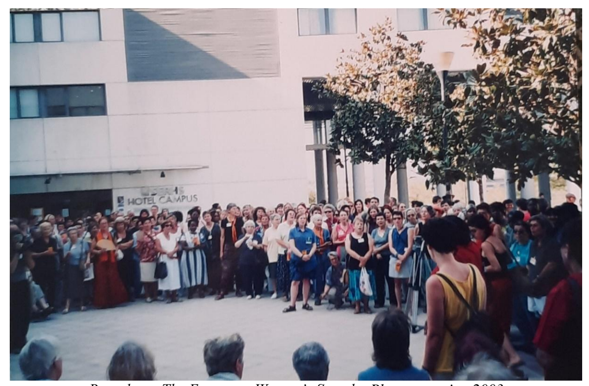
Barcelona. The European Women's Synod – Plenary session 2003

We have called such a home the "Base Christian Communities' Women's Groups" as it is around their experience that a common trajectory and a network of relations have been formed. Many other women, both groups and individuals have met around this table, led by a common quest for the divine and mutually recognizing the richness in different contributions and in the sharing of strong emotions, new languages and imaginaries.