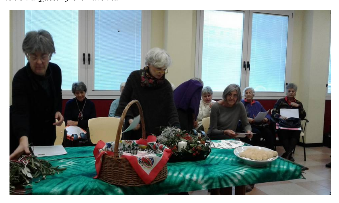
Setting the table for the Eucharist -Verona, National Conference 2016

Organized by the Women's group of the Viottoli Base Community, Pinerolo in collaboration with "Women on a Quest" from Ravenna