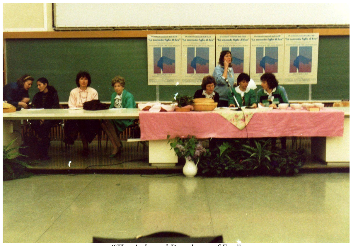
"The Awkward Daughters of Eve" The Base Communities and Women's Research" held in Brescia in 1988

As well as these developments which invested the whole Community, a critical consciousness was beginning to make itself felt amongst the women. This had to do both with the patriarchal and hierarchical Church and our own sitz im leben: the "setting in life" and vital context from which an oral narrative tradition and then a written text, would subsequently spring. All this was happening within communities which were, however, conditioned by a masculine imprinting difficult to by-pass. We faced this problem in a seminar entitled "The Awkward Daughters of Eve. The Base Communities and Women's Research" held in Brescia in 1988. There, for the first time, an all-woman group presided over the Eucharist, an event which hit the headlines. The newspaper "Repubblica" entitled its article: "Ten women at the altar. At Brescia Base Communities defy the church's ancient prohibition".