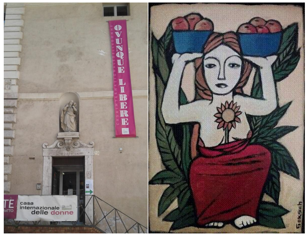
The Internation Women's House and the symbol of our XXIII Conference

We thus chose to make ourselves available to meet and exchange views with other women who like us are, in this historical moment, creating transformative thought and practice, taking the conflict necessary to this process in our stride. Women's voices are currently and powerfully emerging and are being heard all over the world. The feminist revolution has empowered our speech. It has not, however, been without a backlash which we discern in the continuing increase in domestic violence and femicide all over the world. The most reactionary factions in the Church and in politics are attempting to bring things back to "normal" or even take us back to the "dark ages".