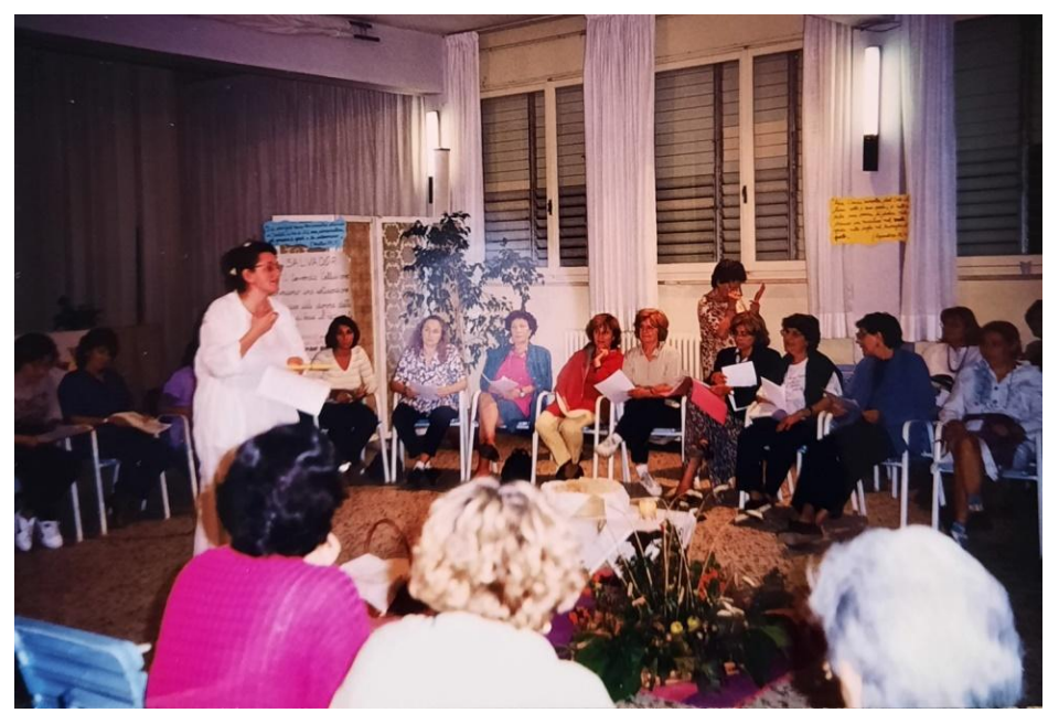
Base Communities' women's groups join together with others of a circle of discussion and meditation

merely human deeds. The act of washing and of compassionately taking care of someone is deeply rooted in the gospels and Antigone's sacred act consists precisely in this as she throws abundant water on her dead brother's blood.