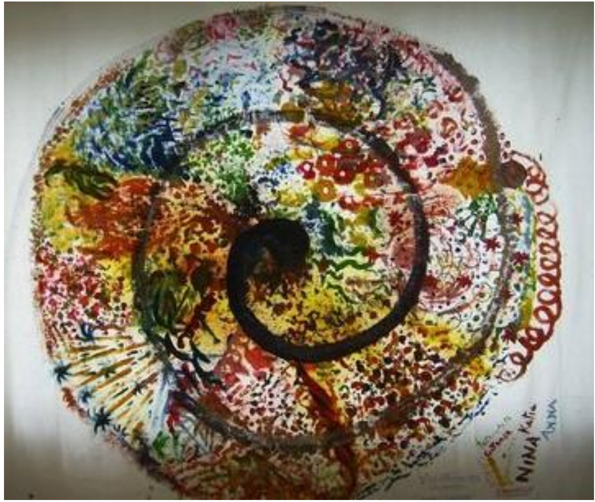
The picture of spiral creation, with us since the Cavoretto Conference in 1996

different things to say. Our journey has thus helped us create a place of true fellowship from which we can gather that strength, authority and power - fruit of a feminine view of the world — and then contribute it to places where men and women meet together.