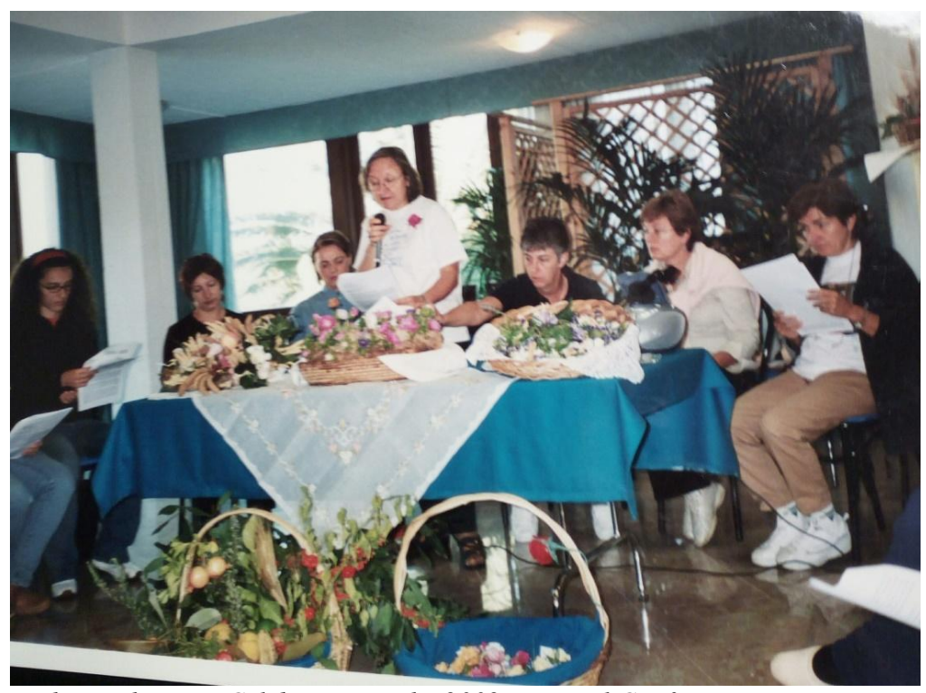
The Eucharistic Celebration at the 2002 National Conference in Frascati