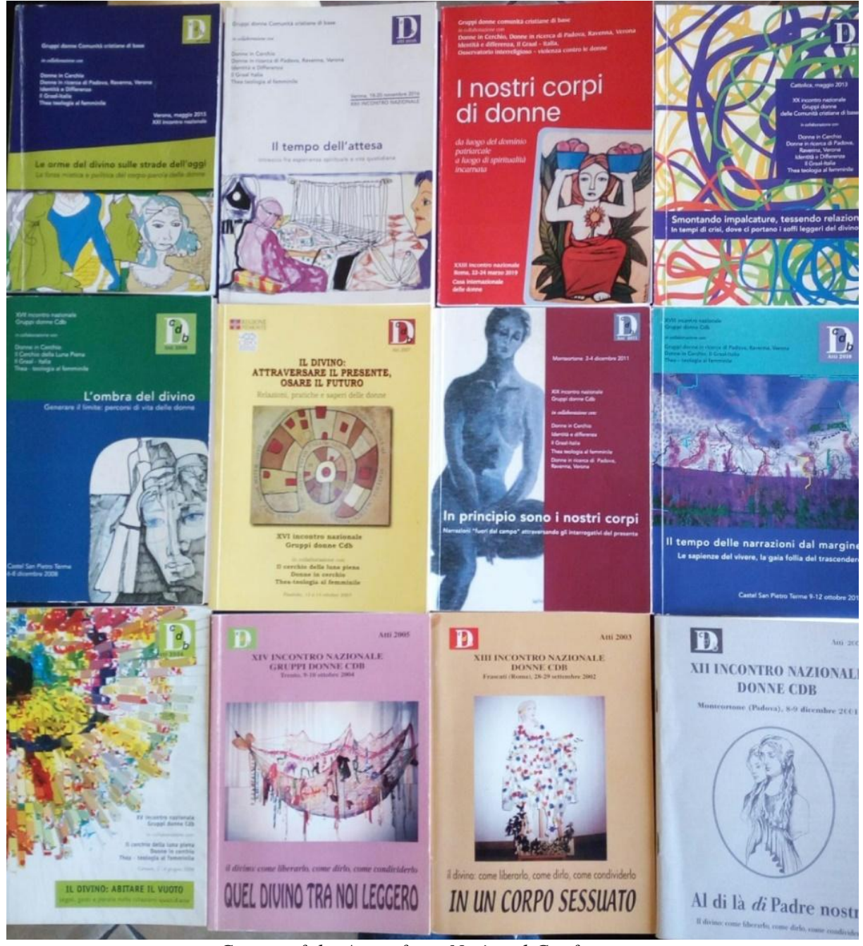
Covers of the Acts of our National Conferences