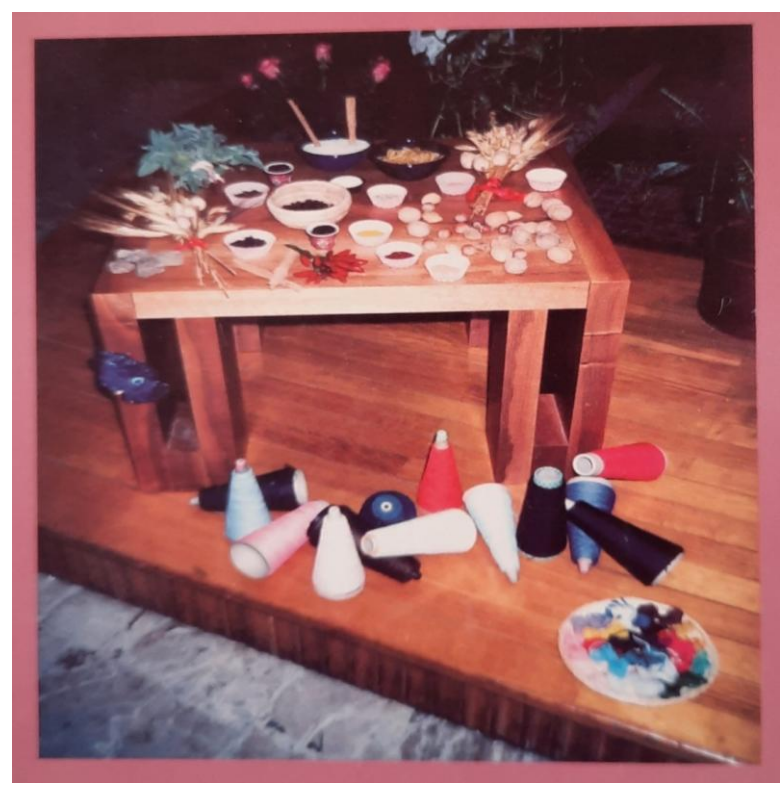
Weaving and painting: tools and themes in the celebration organized by "Circle Women" (Rome) at Trento in 2004